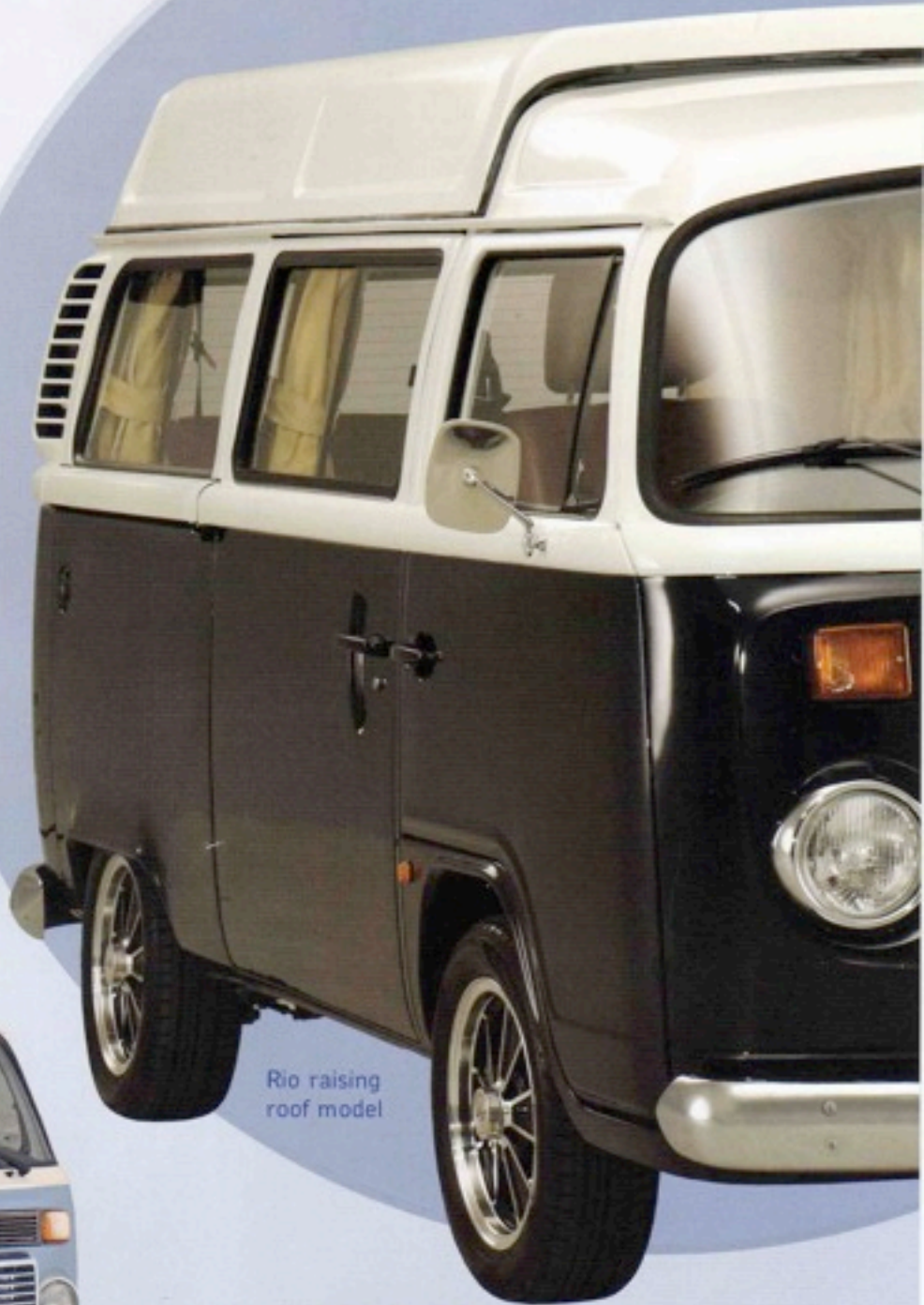
Rio raising roof model