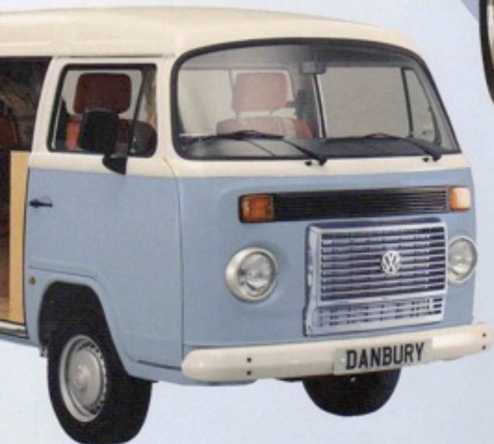
Diamond fixed roof model